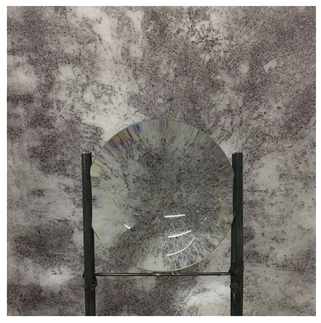
Where are you based?

I am based in Haarlem Artspace in Wirksworth.